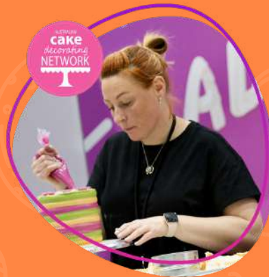
ACDN All Star Stage