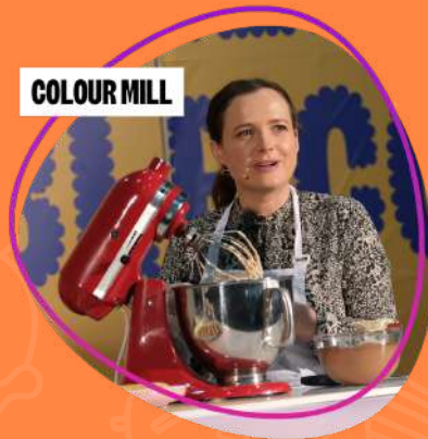
Colour Mill Cake Decorating Stage