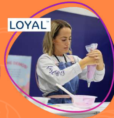
Loyal Demo Stage